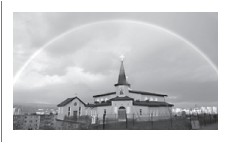
A rainbow is captured over the Church of the Nativity of Jesus in a 2004 photograph. As the parish prepares to celebrate its 20th anniversary, your faithful support is remembered for transforming a small mission into a thriving parish that serves the area's Catholics and reaches out to people in need in the name of Christ.

Your generous support and prayers has been vital to the success and on-going ministries of our work here. Watch for our next issue of the Mission to Magadan newsletter where we will revisit many of the import events in the history of the parish.