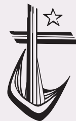
Archdiocese of Anchorage, Alaska