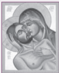
Holy Mother Mary of Magadan Pray for us.