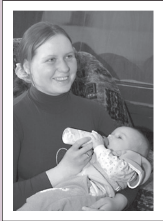
A baby is fed during a gathering of young mothers. The parish's pro-life activities include counseling, resources, a food pantry, support meetings and sometimes housing for young mothers who need help.

T he parish of the Nativity of Jesus is 20 years old and a pro-life conference titled "Life: A Gift to Receive, Celebrate and Protect" will be central to our anniversary observances in November.