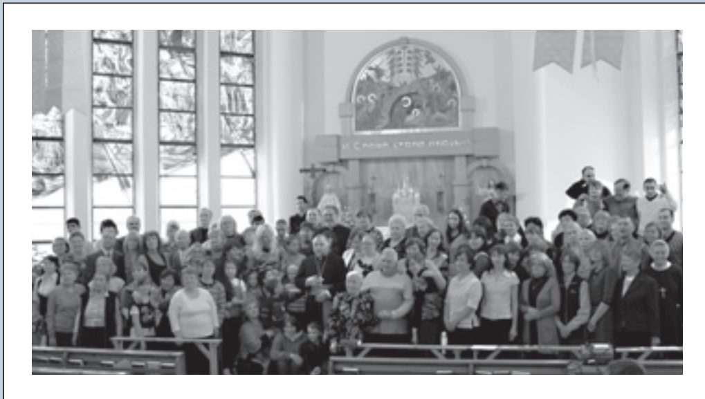
Clergy, sisters, parishioners and guests gather for the anniversary mass at the Church of the Nativity of Jesus. Your continuing support of the Mission to Magadan helps ensure a vibrant parish and important ministries long into the future.