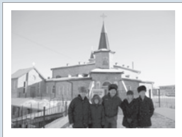
Guests came to Magadan from all over the world to celebrate with the parishioners of the Church of the Nativity of Jesus. Thanks to many years of your faithful support of ministries in Far East Siberia, the parish celebrated twenty years of ministries and looks forward to these vital ministries continuing long into the future.