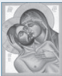
Holy Mother Mary of Magadan Pray for us.